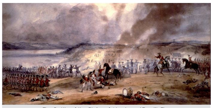
The Battle of the Plains of Abraham.

As the French advanced towards the British, their lack of coordination soon proved evident. They