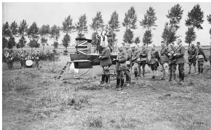
General Currie at a September Memorial Service to men who fell during Hill 70 advance.

Currie said afterwards that Hill 70 was "... the hardest battle in which the Corps has participated. It was a great and wonderful victory. GHQ regard it as one of the finest performances of the war."